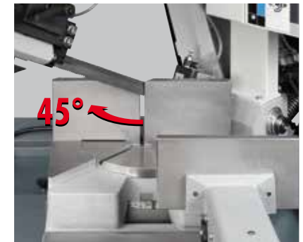
PH 262 - PH62HB