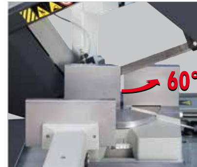
PH 262 - PH62HB